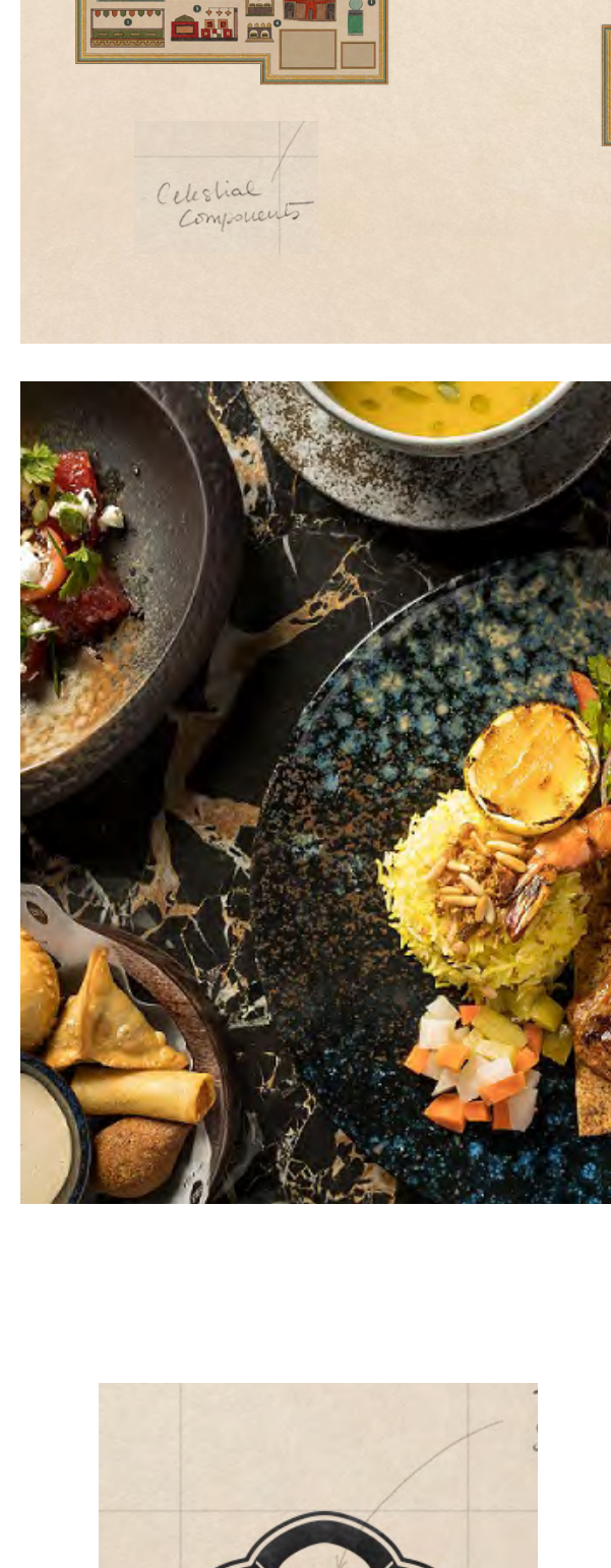
One&Only ONE ZA'ABEEL WIP