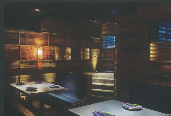
Relaxed atmosphere for food and drinks