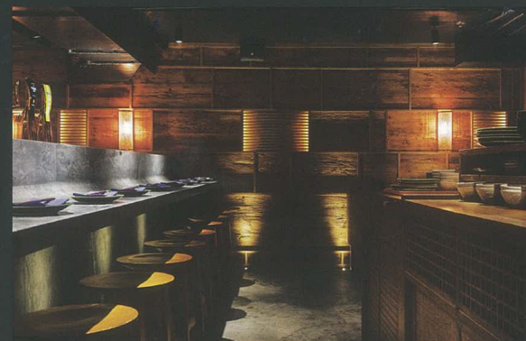
Comfortable setting by simple carpentry