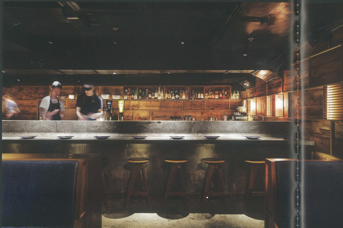
Izakaya for people to unwind after work