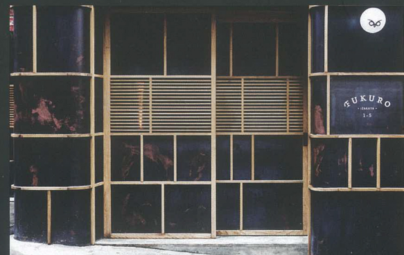
The exterior design