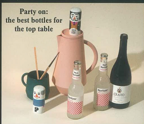
Party on: the best bottles for the top table

PLUS: fresh takes on happy fashion, Christmas markets and winter cinema