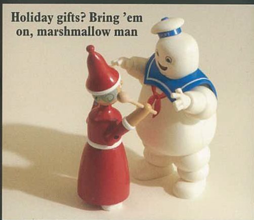
Holiday gifts? Bring 'em on, marshmallow man